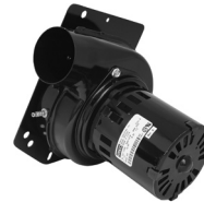
FIG. I W9