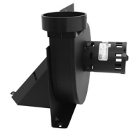
FIG. J W10