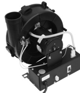
FIG. C W4