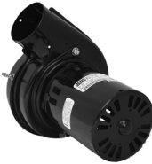
FIG. H W8