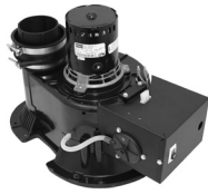
FIG. B W2