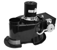
FIG. E W5