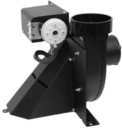
FIG. F W6