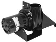
FIG. G W7