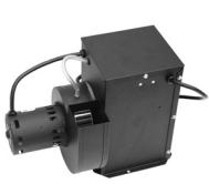
FIG. A W1