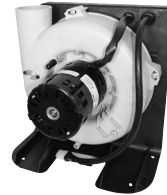
FIG. D W3